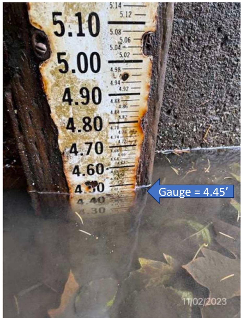
Nov 2 nd 2023, Boards removed, low water levels not flowing from lake