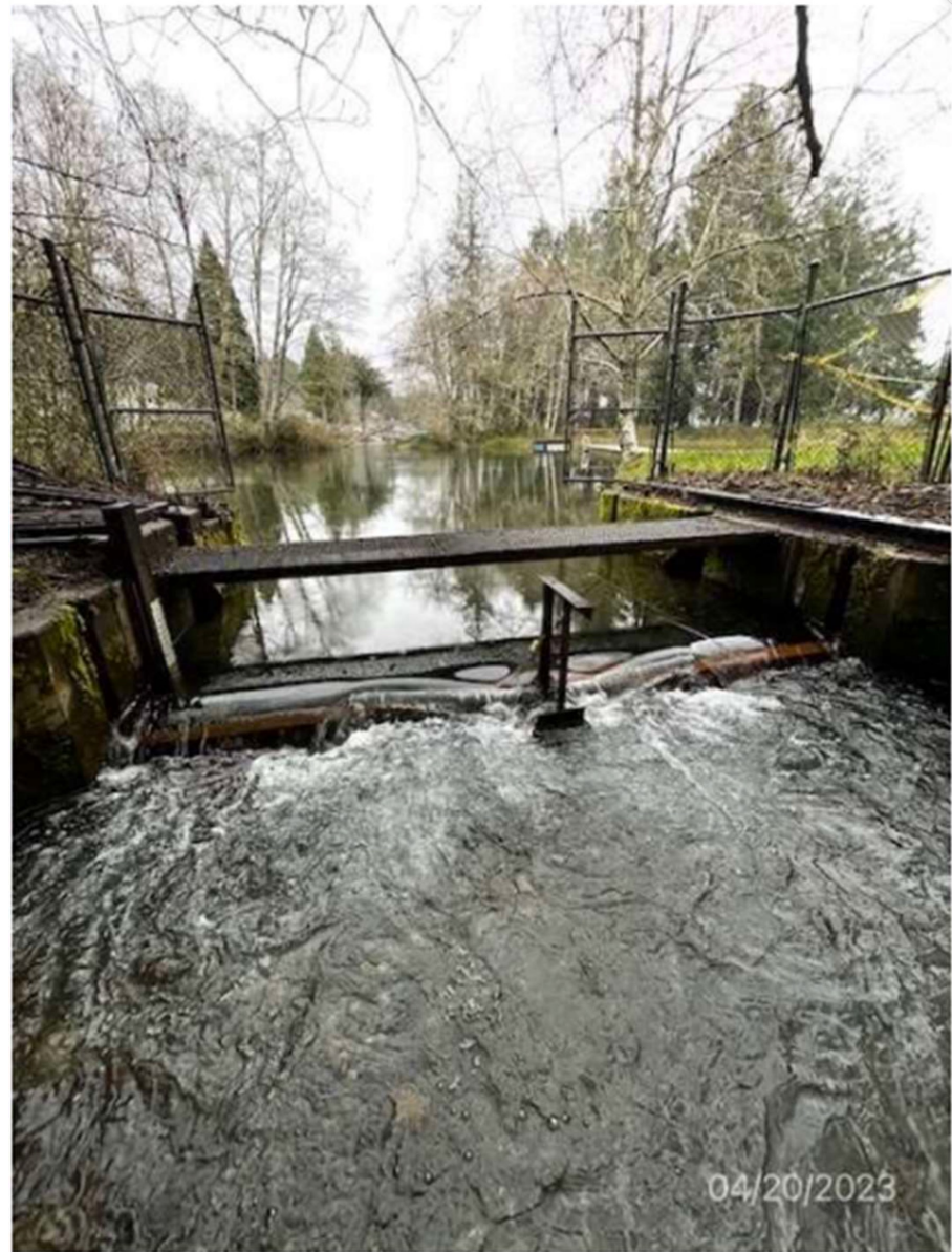
April 20th 2023, water flowing